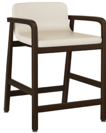
Model: MDDCST111 22W 22.5D 32.25H 19.5SW 18SD 24SH 28.5AH

Chic and minimalist, the pre-molded seat of the Madrid Counter Stool has no separation, retains its shape, is smooth and comfortable. The seat fits inside the stool frame, made of easily cleaned Classic Kwalu material with stretchers on all sides. The Madrid is suitable for use at bars, counters, and high tables.